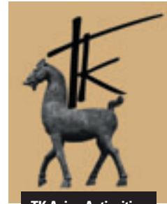
TK Asian Antiquities

A new show has been added to our schedule, the inaugural Fall International Antiques Fair at the Merchandise Mart in Chicago. The show will run October 12th thru the 15th. We look forward to seeing our Midwest clients twice a year now!