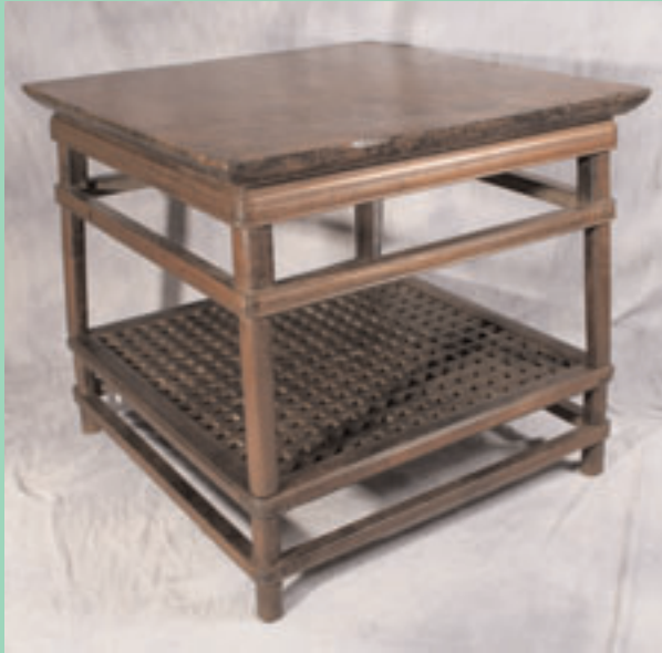
This beautiful square altar table is one of the very few known 17th Century Yunnan burlwood tables with the original base. Tabletop detail, right.